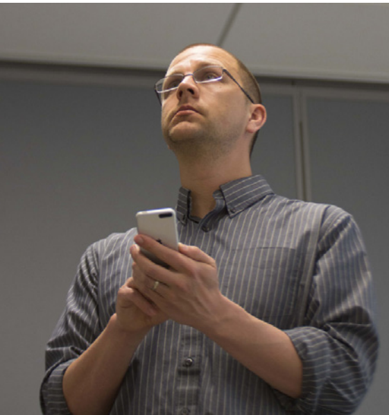
Adjusting light levels using handheld device.