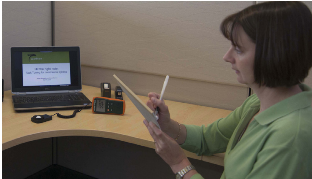
Measuring light levels on the working surface.