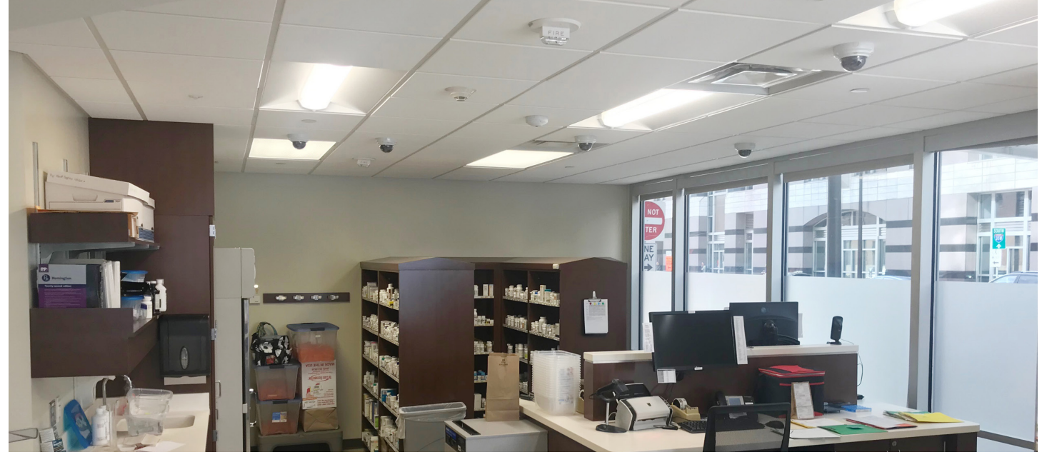
Controls are particularly impactful in the pharmacy, where light levels (and therefore base energy usage) are higher.

but these calculations were lacking in some cases, requiring field measurements of illuminance as commissioning progressed.