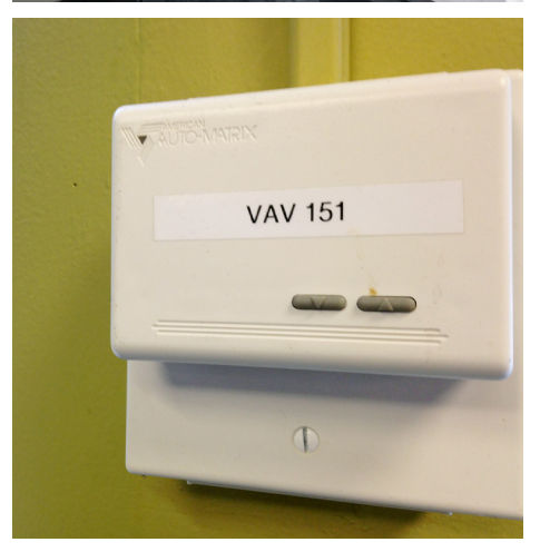
( Top ) The fitness center is infrequently used, making controls effective. ( Middle ) Locker rooms were included in both lighting and HVAC control. ( Above ) The building's VAV system utilizes the sensing to turn down individual zones when nobody is present.