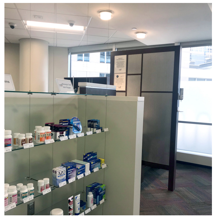
Lighting quality was improved in nurses areas.